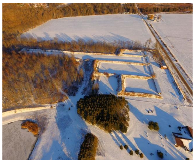
An aerial view of the ranges covered in snow